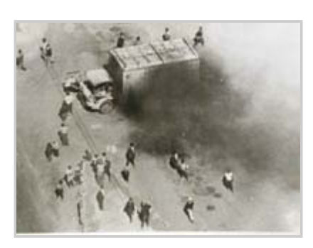
Truck burning with crowd, Alexandra.

[T]he body was partially naked, her private parts were burned, and [there was] a knife wound between the eyes, as well as knife wounds on her breasts and shoulders. We took the body to Meadowlands police station and left it there. While the body was in our care, it was not further damaged. Our vehicle was also not involved in an accident while we were transporting the body. It was to all appearances clear that the woman concerned had been killed in the most brutal way. 107