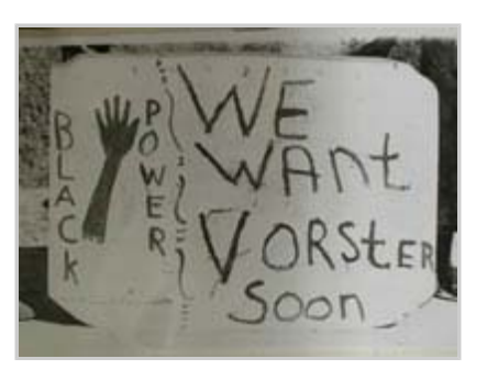
Poster: "Black Power, We Want Vorster Soon," Alexandra.