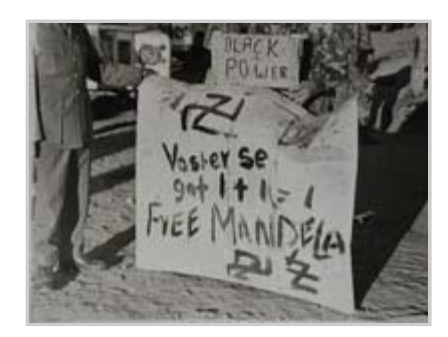
Poster: "Black Power, Free Mandela," Alexandra.