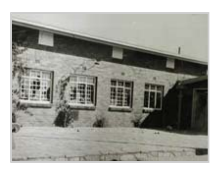
WRAB office outside, Katlehong.