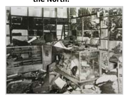
Looted store, Alexandra.