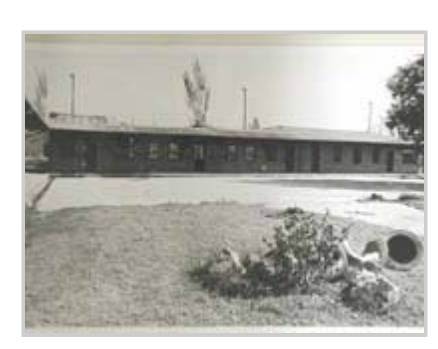
Destroyed school, Alexandra.