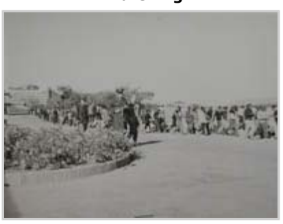
Part of the student march, University of the North.