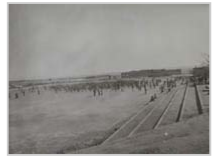
Students of the University of the North.