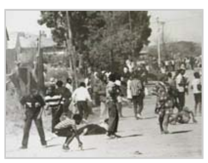
Anxious Alexandra crowd, Alexandra.